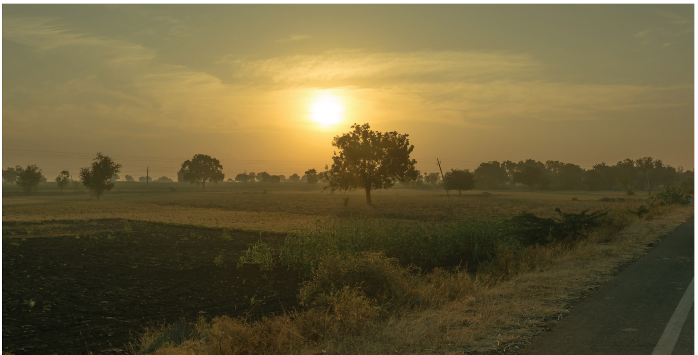
Open land in the outskirts of Delhi, India

Recommendation: States should understand the strong interdependence between urban and peri-urban areas and how natural ecosystems serve a different purpose than agricultural land. The National Urban Policy Framework provides guidelines to states, keeping in mind the relationship between cities and peri-urban areas, and asks institutions to look beyond municipal boundaries. 20 Policy-makers also need to recognise commons, such as wetlands, for their multiple uses, including supporting biodiversity, livelihoods, and not just as resources ready for 'extraction'. Planning strategies should seek to maximise not only food and livelihood security, but also climate adaptation measures.