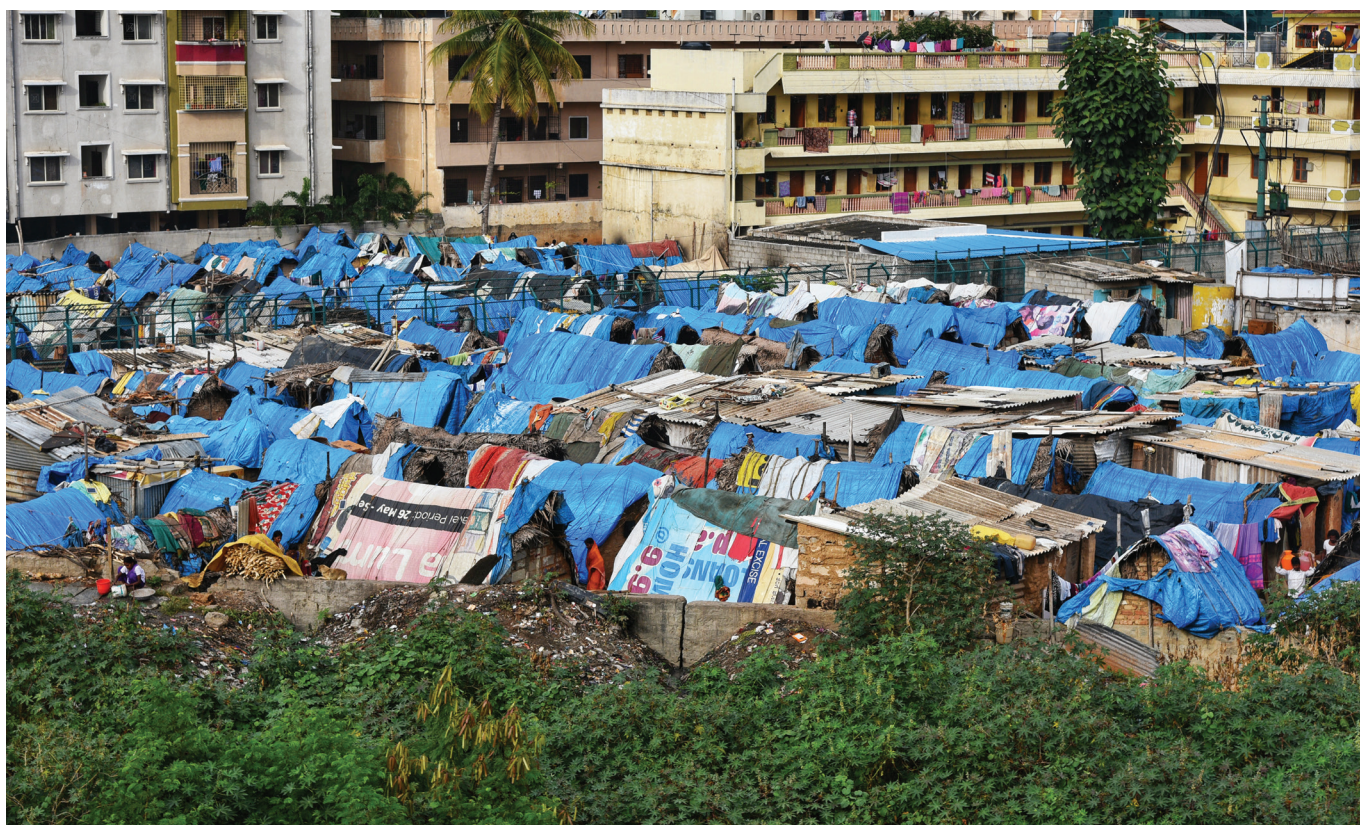
Makeshift houses in the middle of a planned colony in a suburb in Bengaluru, India

Natural ecosystems and built infrastructure also have unique roles, protecting against certain environmental and climate risks, and meeting developmental needs of inhabitants respectively. Infrastructure should be planned for and designed in harmony with natural ecosystems. Cities and peri-urban areas also need to collaboratively manage ecosystems to balance trade-offs. For instance, industrial pollution in peri-urban areas adversely affects agricultural production, in turn affecting the health and food security of urban and peri-urban residents. Stricter law enforcement and regulation can potentially ensure safer production of crops, while still allowing for new industry to flourish. 21