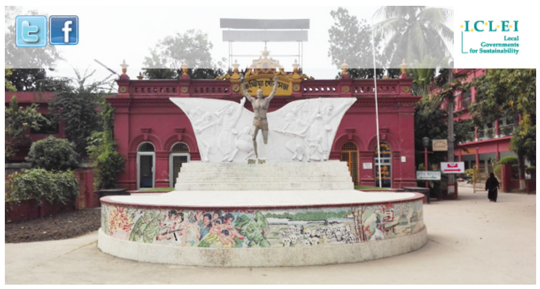
ICLEI South Asia E-News

Forward this message to a friend | Click to view this email in a browser