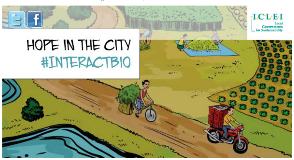
ICLEI South Asia E-News

Forward this message to a friend | Click to view this email in a browser