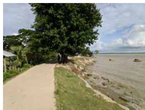
Figure 1: A critical embankment protected by a banyan tree near Galachipa Upazilla, Patuakhali.