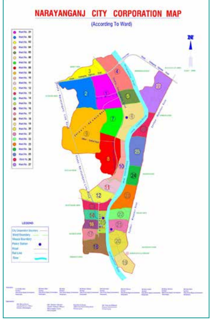
Figure 1: Narayanganj City Corporation map