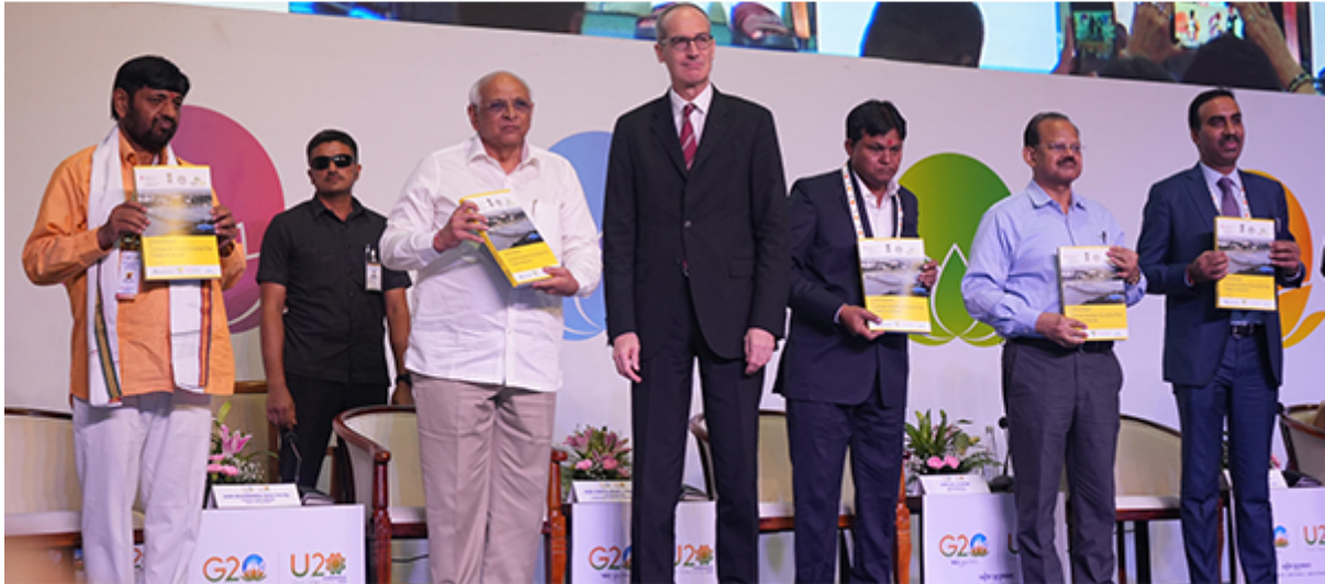
ICLEI South Asia E-News