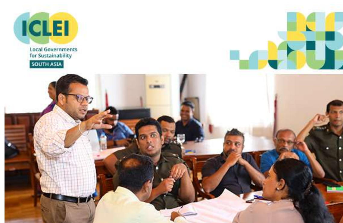
A seven-day capacity-building initiative by ICLEI South Asia equips local governments in Kandy and Nuwara Eliya, Sri Lanka, with tools for sustainable urban resilience.