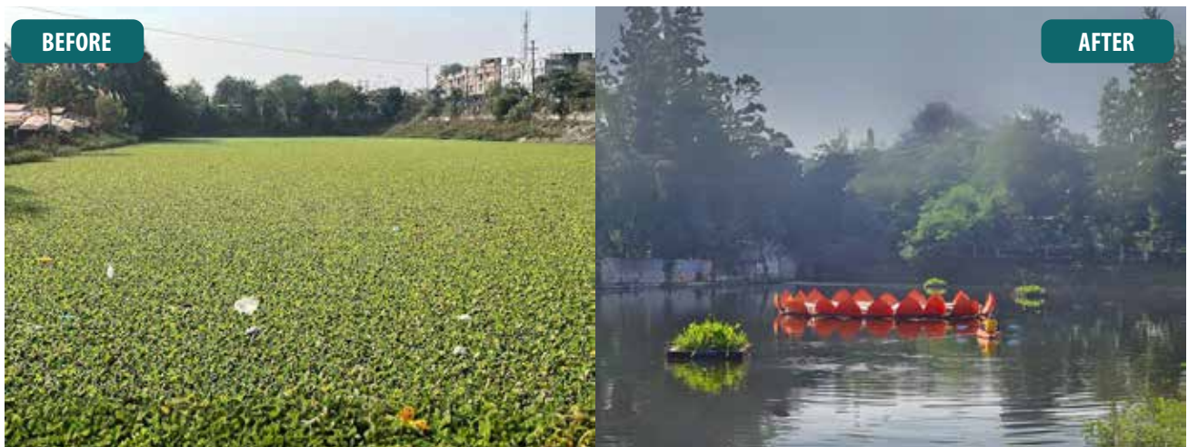
Figure 3: Annapurna Lake before and after restoration

Future initiatives should institutionalise long-term monitoring to strengthen regulatory enforcement, include ecosystem service assessment, and integrate capacity-building to ensure sustainability.