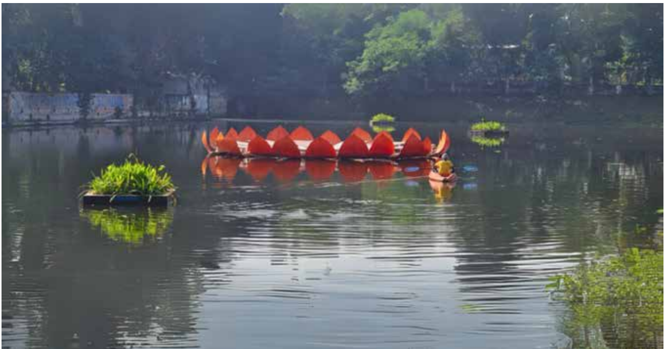
Figure 1: Lotus shaped solar aerator in Annapurna Lake

Complementary measures were taken to address the risk of re-pollution in the future. Boundary walls of the water body were raised to prevent encroachments and waste dumping; sewage bar screens were installed to block the entry of solid waste; water hyacinth was removed to maintain the lake's aesthetic value and ecosystem health; and educational posters on responsible waste disposal were developed.