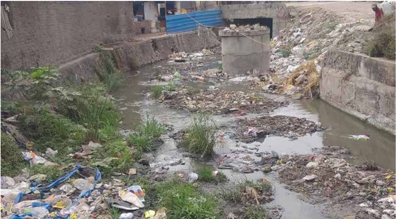
Figure 10: Kham river before restoration

and Maintenance). The methodology is meant to overhaul and systematise solid waste management , and is also used for water body restoration and climate action planning. The framework seeks to ensure that ecological restoration is sustained by systems thinking and community will, not just infrastructure.