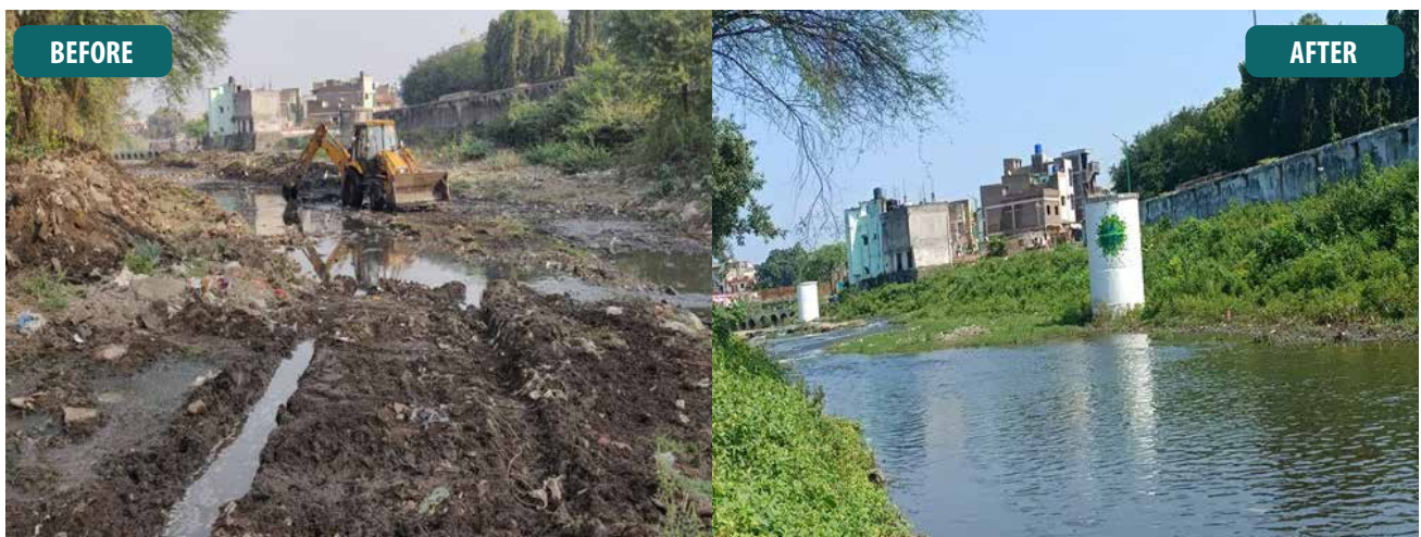
Figure 12: Before and after restoration

The Kham River Restoration Mission highlights the significance of implementing integrated, adaptive management using low-cost, context-specific solutions; combining technology with nature-based interventions; strong inter-departmental coordination and continuous community engagement; use of tools such as the BOTRAM framework; and significance of sustainable waste management.