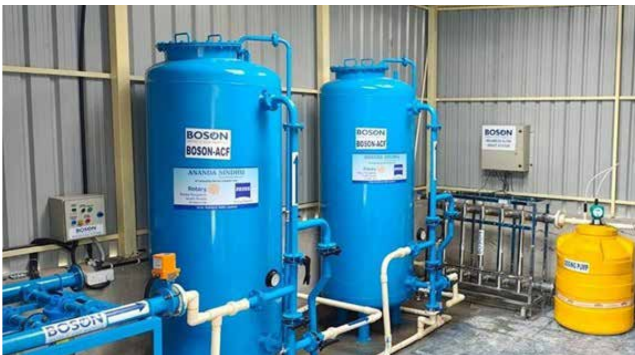
Figure 7: Tertiary treatment

The success of the project was measured through water quality monitoring, adherence to water quality standards such as BIS 10500, volume of treated water supplied to the residents of Devanahalli, number of beneficiaries, energy saved and cost-effectiveness of the initiative, reduced dependence on deep borewells and dimensions of waterbodies rejuvenated.