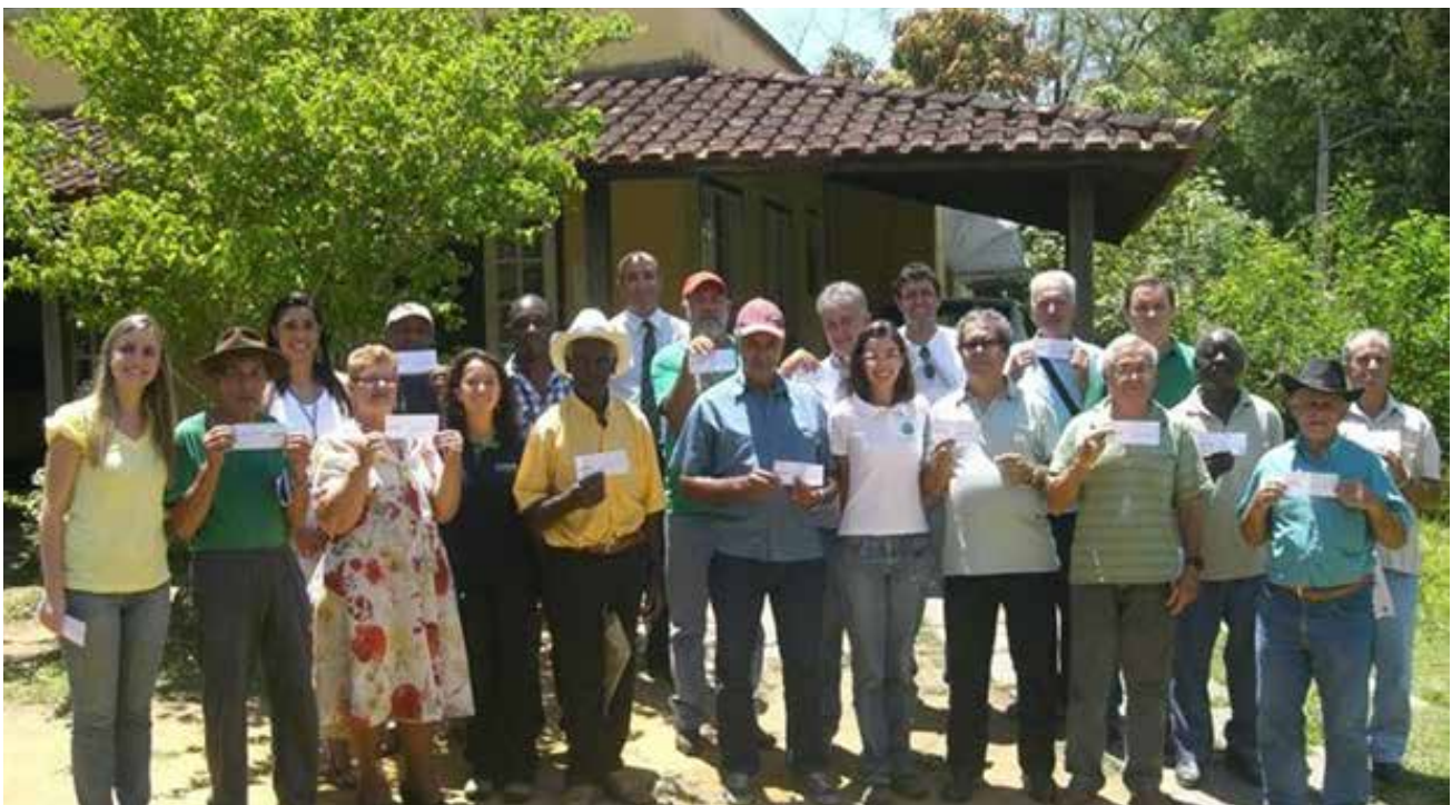
Figure 17: Community consultation

Currently, the project is being monitored by 70 rural landowners who are playing a key role in the conservation of about 4,562 ha, and the restoration of 564 ha. A cost-benefit analysis was performed prior to the PAF project at Rio Claro.