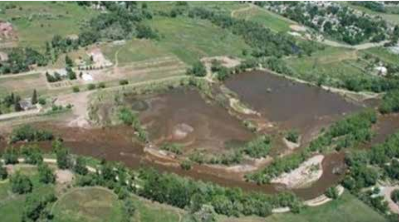
Figure 9: Area after restoration

Social and Recreational Outcomes: Restoration work improved access to the river and nearby natural areas. Trails, fishing access points, and safer entry areas were incorporated into the design. Lowered banks and removal of hazardous structures improved public safety, particularly for float boating.