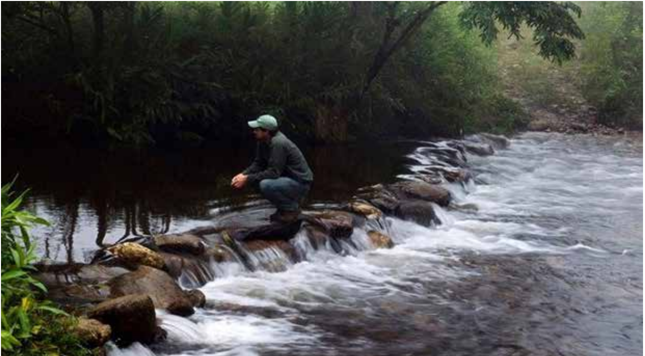
Figure 19: Restored Guandu river basin