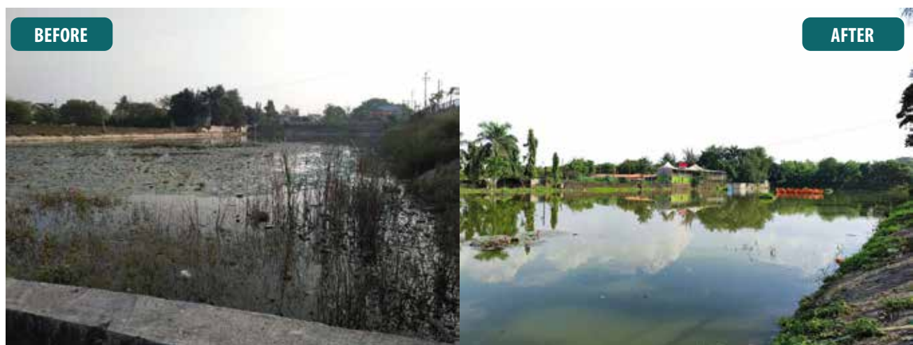
Figure 2: Annapurna Lake- before and after restoration

For its efforts to restore Annapurna Lake and other lakes, the Ministry of Jal Shakti, Government of India, awarded Clean Water the title of "Water Hero".