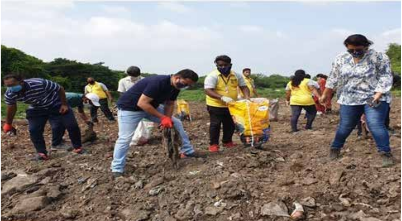
Figure 11: Restoration work in progress

Low-cost, adaptable interventions such as floating plastic traps, soak pits, and decentralised greywater treatment plants were deployed for quick results, while remaining scalable and context-sensitive. Socially, the mission placed people’s participation at the core, organizing 180+ public events, school campaigns, and riverfront activities to rebuild the social connect with the river.