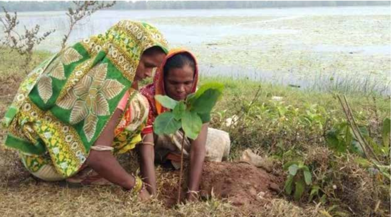
Figure 22: Undertaking plantation activities