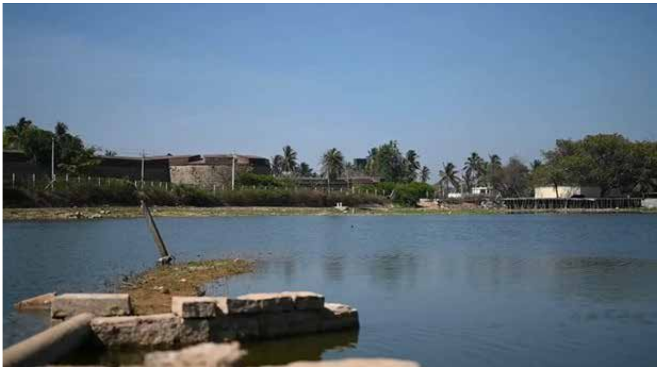
Figure 6: Bagalur Lake