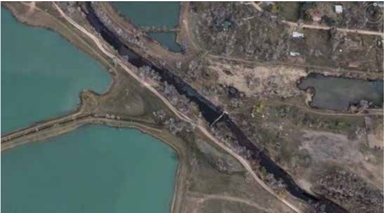
Figure 8: Poudre River Zone

These physical changes affected ecological functions. Wetlands lost some of their original capacity to support native species. These disturbed areas also became vulnerable to invasive species. At the same time, rising water demand for agricultural and domestic use also affected river hydrology and ecology. The Josh Ames Diversion Dam, last used in 1985, disturbed the river flow and impeded fish movement.