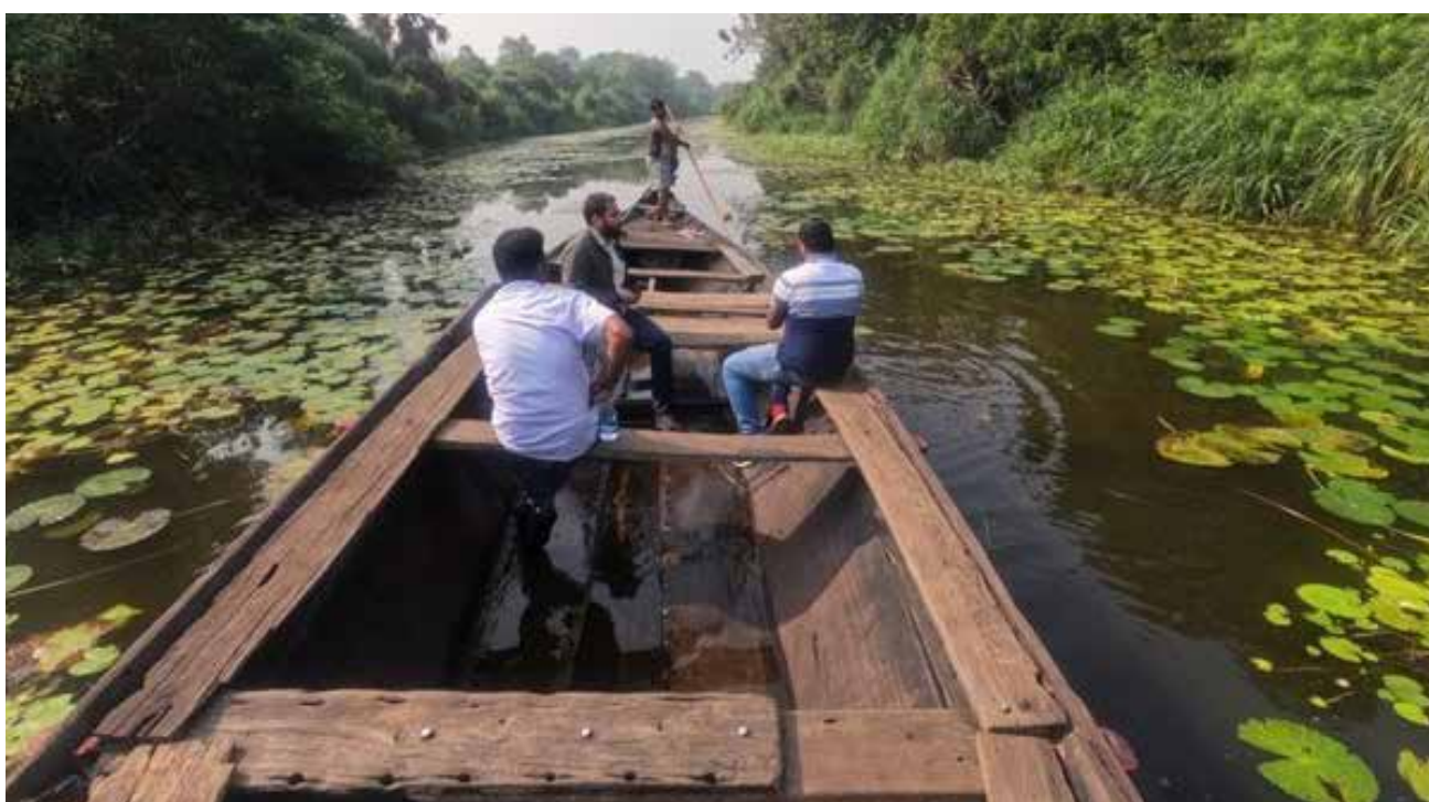
Figure 23: Restored Tampara Wetland

Going forward, better coordination across sectors, clearer documentation of hydrological changes at the basin level, and stronger integration of ecosystem considerations into development planning would support further progress.