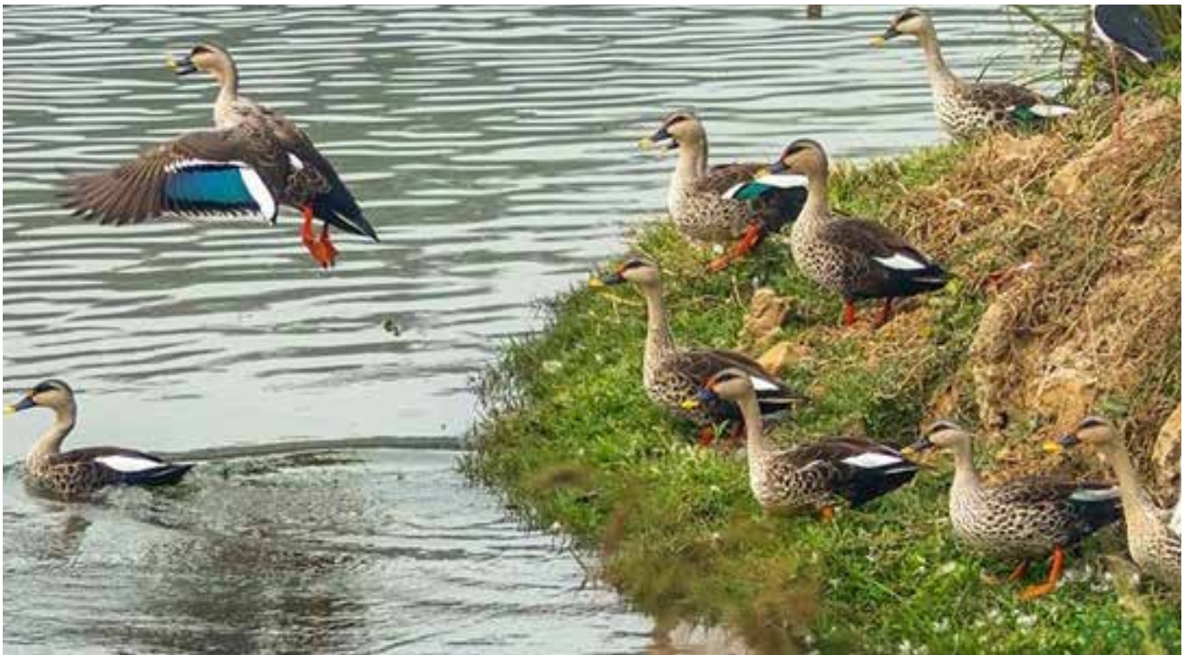
Figure 15: The site is a haven for birds now

Socio-Economic and Recreational Outcomes: The Neela Hauz Biodiversity Park provides accessible open space in a densely built urban area, attracting visitors for walking, birdwatching, and environmental education. Schools and universities use the park as a field site for ecological learning and research, integrating it into academic curricula. The project generated employment during desilting, landscaping, and ongoing maintenance activities, although detailed long-term employment figures are not available.