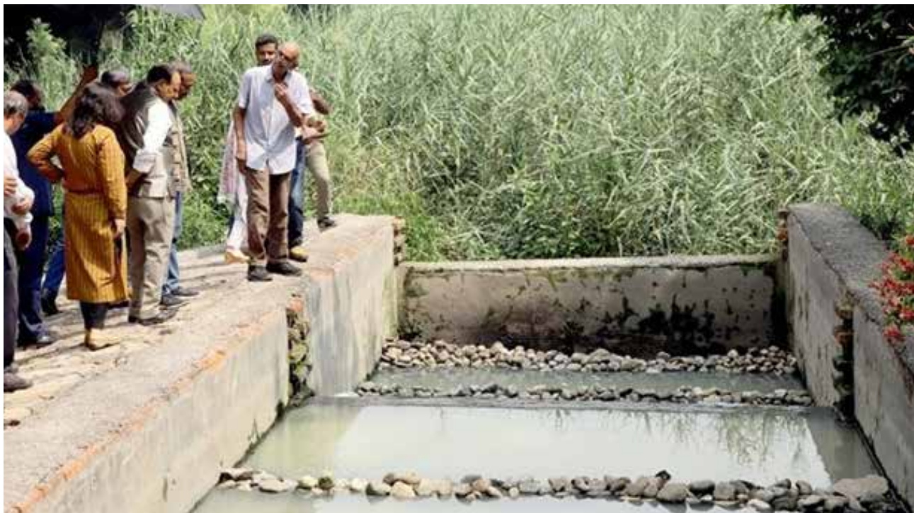
Figure 13: Constructed wetland at Neela Hauz