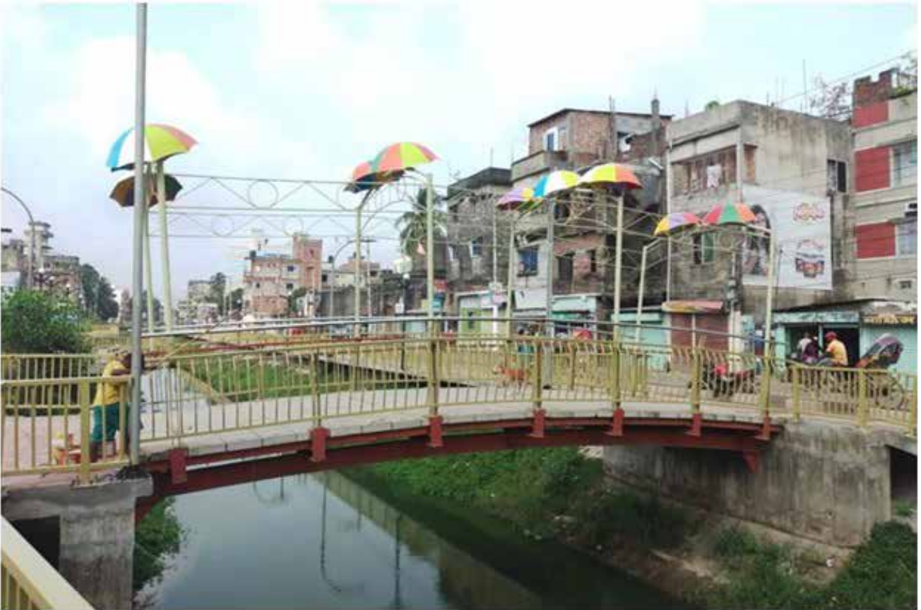
Figure 5: Restored Baburail Canal with walkway

The project assessed performance using qualitative and quantitative indicators, including canal mapping, physical measurements of restored sections, documentation of plantation, cost-effectiveness analysis, stakeholder interactions, and community and media feedback. The intervention aligns with national water and climate planning frameworks and contributes to broader ecosystem restoration and urban resilience goals.