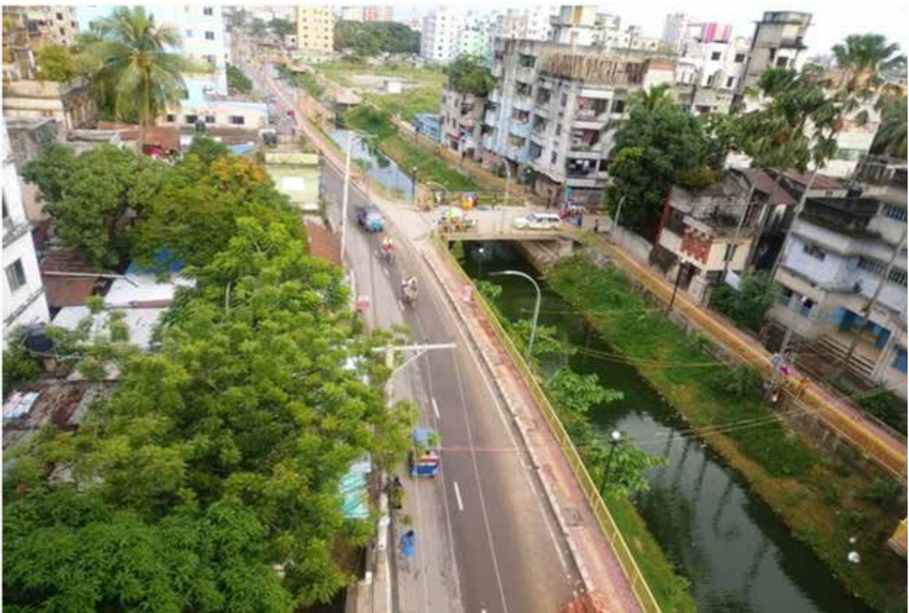
Figure 4: Bird's eye view of Baburail Canal

Public Space Improvements: Walkways were constructed along both banks, and seven pedestrian bridges and nine vehicular bridges enhanced cross-connectivity. Public amenities, including viewing decks, seating areas, lighting, toilets and drinking water facilities, were installed to encourage use of the space. Landscaping and the planting of 1,150 native trees at six-metre intervals increased shading and green cover. Stormwater drains were constructed to improve runoff management from adjacent areas. The canal was integrated into the broader drainage network, enabling it to function as a stormwater conveyance system.