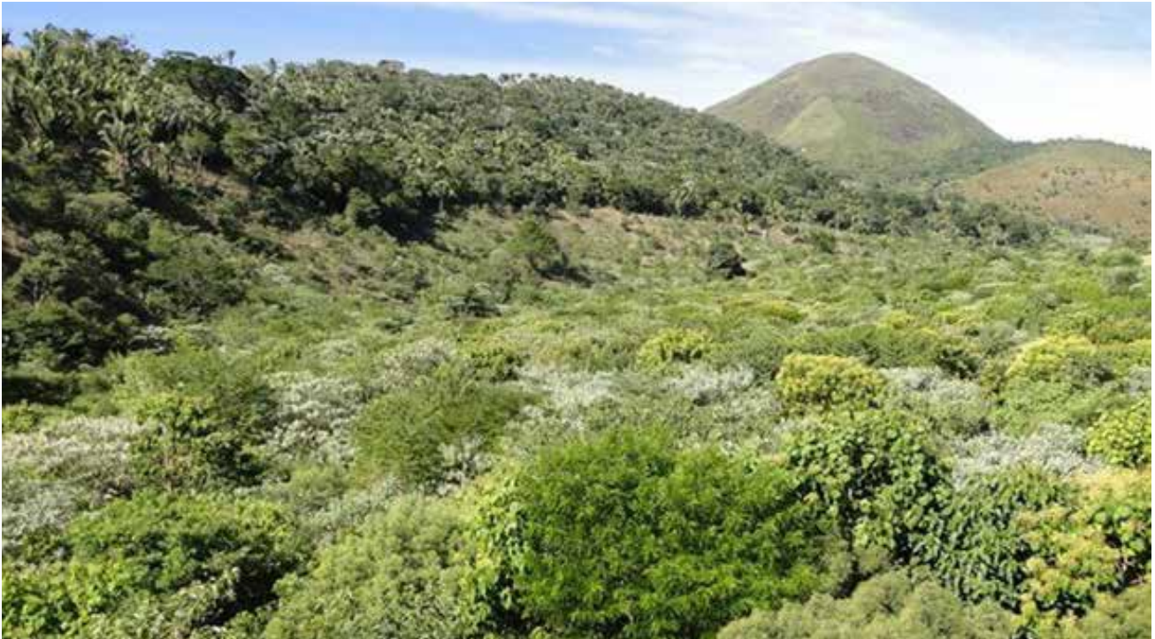
Figure 18: Increase in overall biodiversity