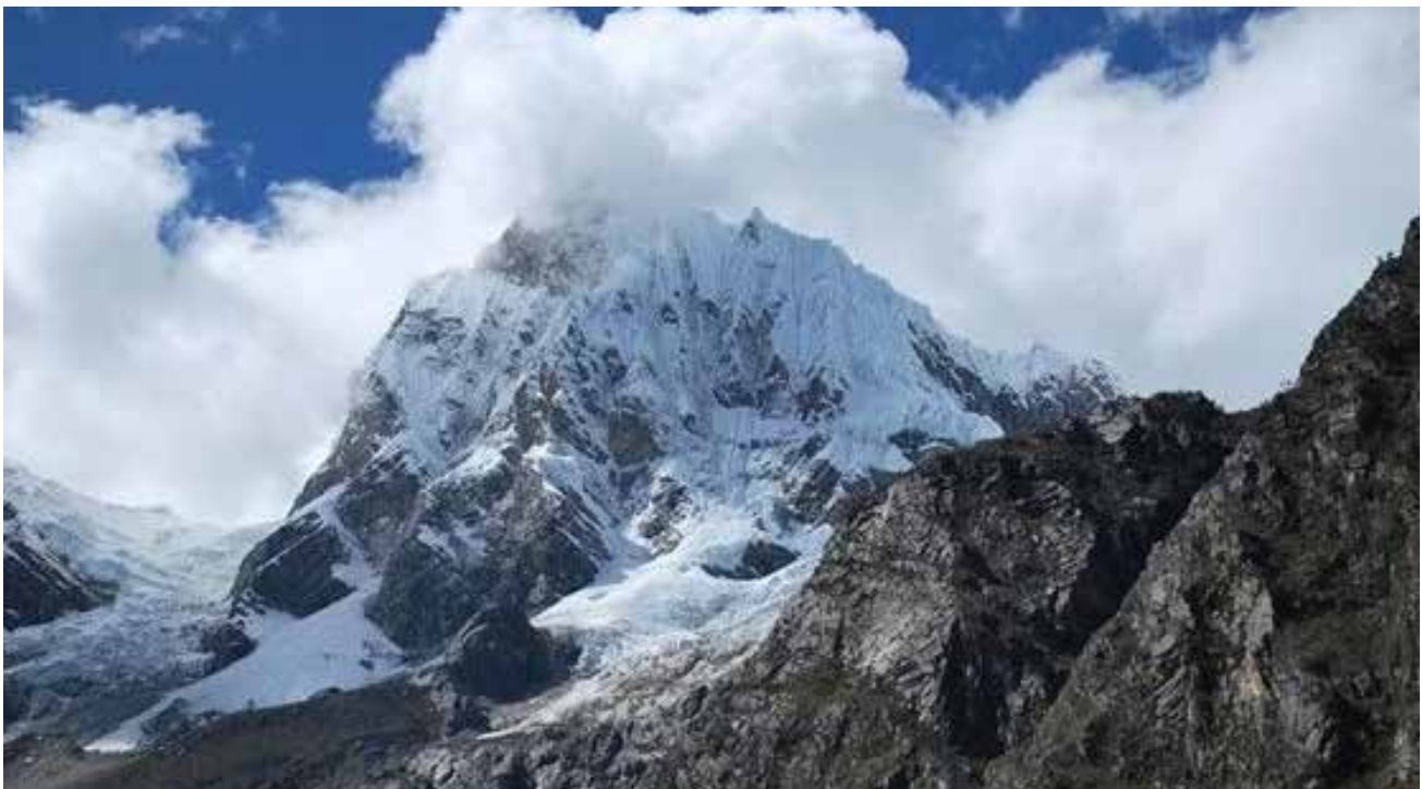
Figure 16: Overview of the region

While glacier retreat continues, the project reduced immediate exposure to glacial lake-related disasters and strengthened local preparedness systems.