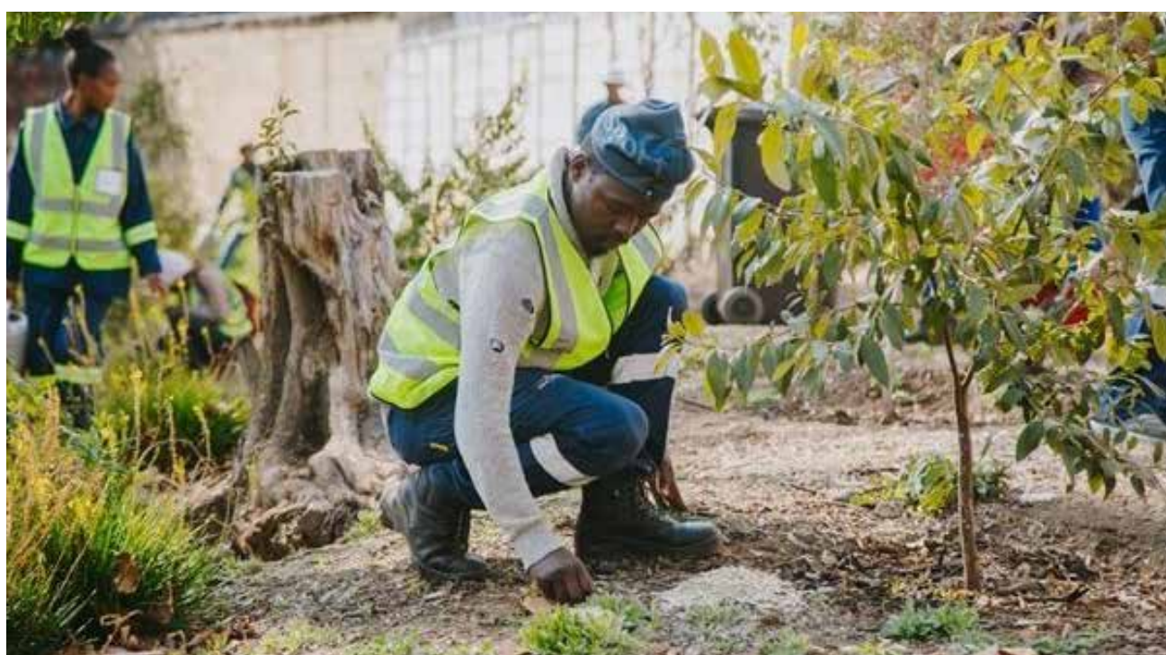
Figure 21: Undertaking plantations