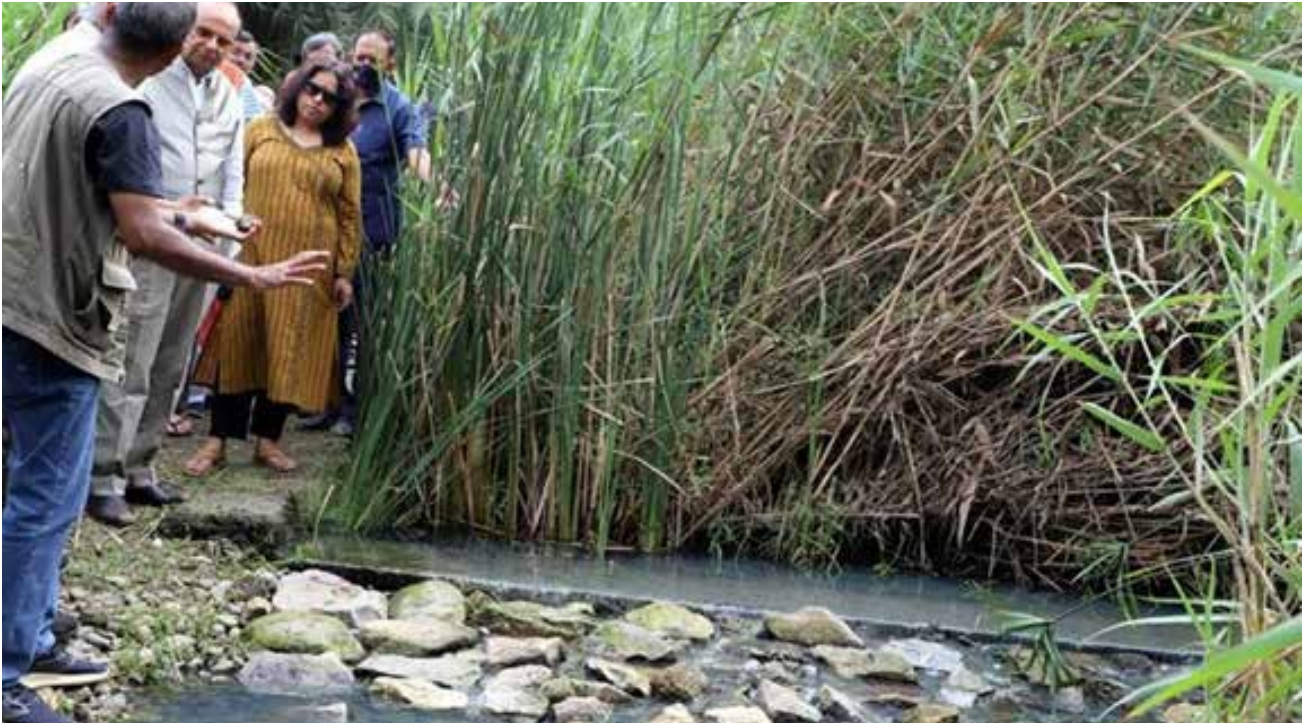
Figure 14: Oxidation pond at Neela Hauz