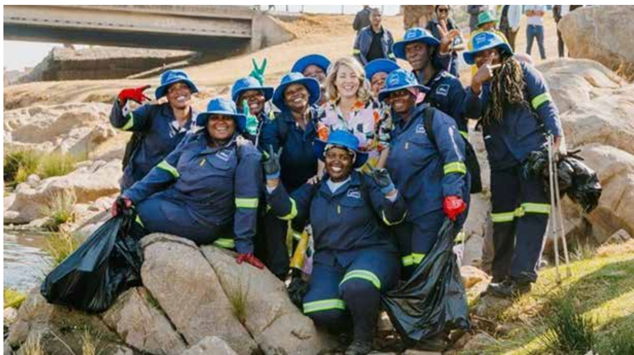
Figure 20: Community participation in solid waste removal